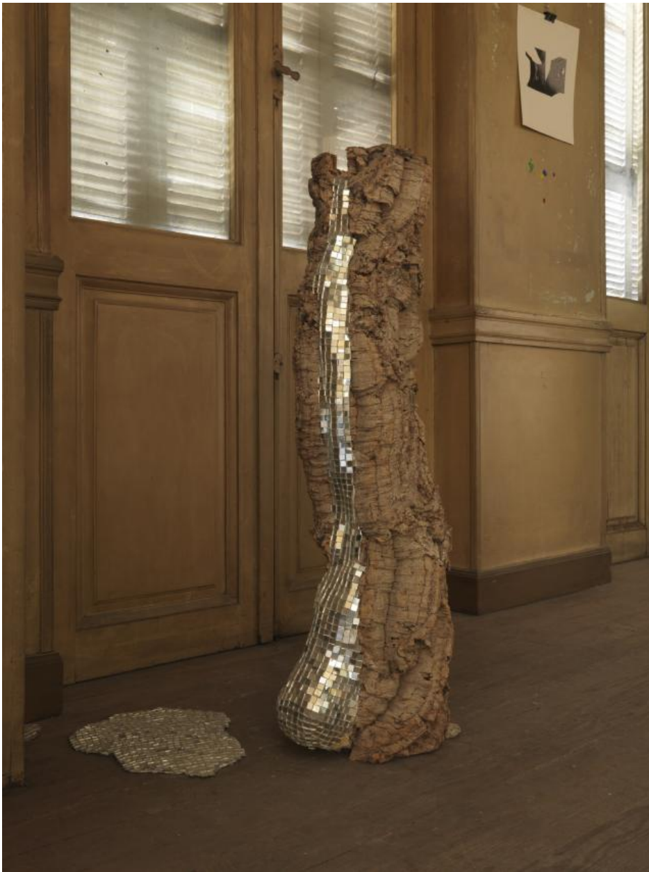
Katerina Kana, Untitled , 2013, sculpture cork and mirrors (100 x 20, 33 x 28, 9 x 9 cm), Courtesy of the artist, Photo by Stathis Mamalakis.

Escaping the square logic of stereotypes, the photographic collages of Katerina Kana move in the interstice of different ideologies and emerge as discreetly iconoclastic. Common spaces, like beaches or urban surfaces, are subjected to an unprecedented view. Through a fragmentary viewpoint, Katerina Kana gives room for a vivid conceptual twist.