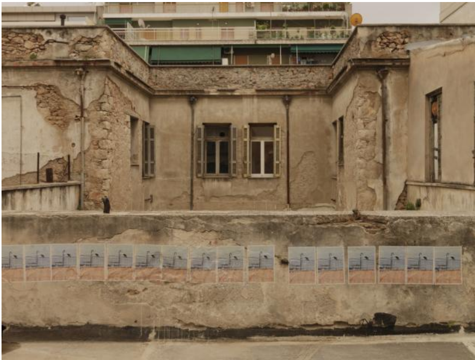
Socratis Socratous , Untitled , 2009, photograph printed on A4 paper, Courtesy of the artist, Photo by Stathis Mamalakis.

For the last decade, Socratis Socratous has been photographing everyday moments, capturing the vibe of the urban landscape. In Kunsthalle Athena we are enlarging one of his pictures of Athens, greeting it as the visual manifesto of the exhibition.