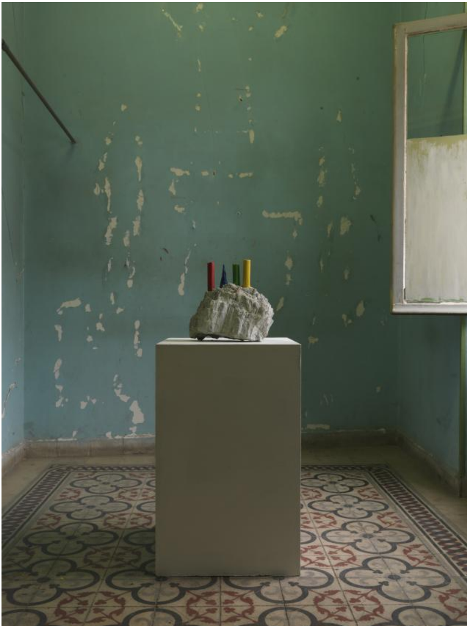
Katerina Kana, A Few Standing Columns , 2013, sculpture rock and plasticine (32 x 32 x 20 cm), Courtesy of the artist, Photo by Stathis Mamalakis.