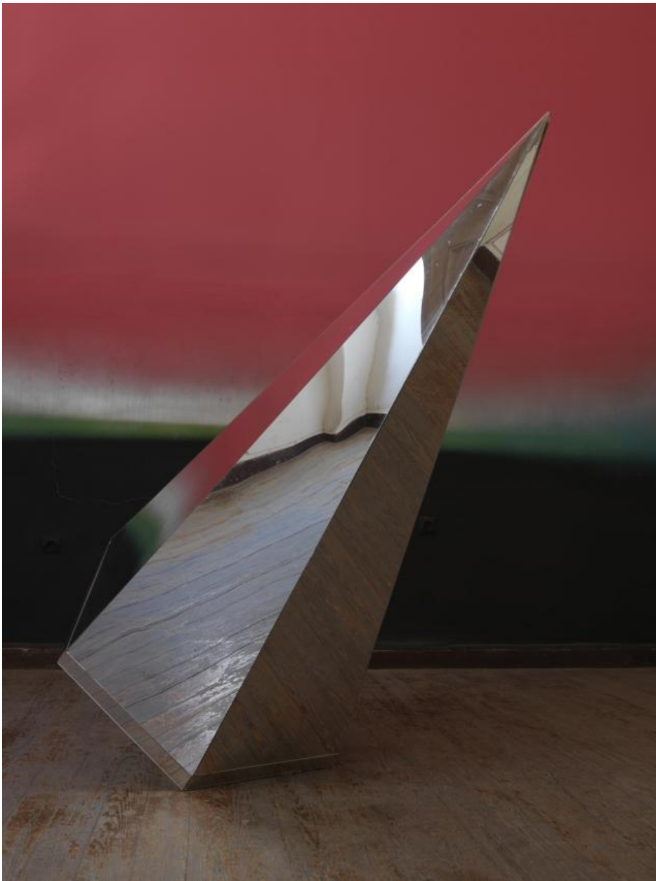
Katerina Kana, Untitled , 2013, sculpture plexiglass mirrors hexagon 170 x 80 cm

Cultural and art institutions with a critical agenda and a self-reflective attitude provide a constant source of inspiration for Kunsthalle Athena. At the same time, the urban cultures of Athens , at the moment of the city's most unpredictable transformation under global forces, provide an intricate learning ground and a concrete point of origin for its activities, direction and prospects of viability. For, in Kunsthalle's critical intervention in the art scenes of Athens, Greece and Europe at large we trust and for the radical curating that present themselves locally and globally we emotionally stand for.