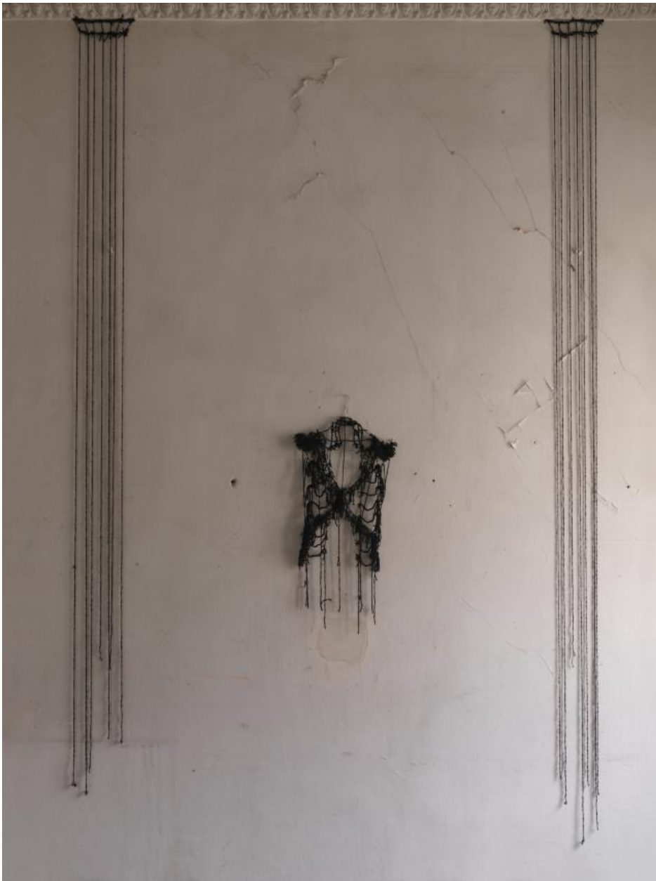
Thanos Kyriakides, Beyond Time Lines (Napoleon Jacket) , 2010, hand knotted acrylic wool yarn (35 x 95 cm) & Beyond Time Lines (Column Sketches) 2013, hand knotted acrylic wool yarn, dimensions variable, from the project Blind Adam , Courtesy of The Breeder gallery, Athens, Photo by Stathis Mamalakis.