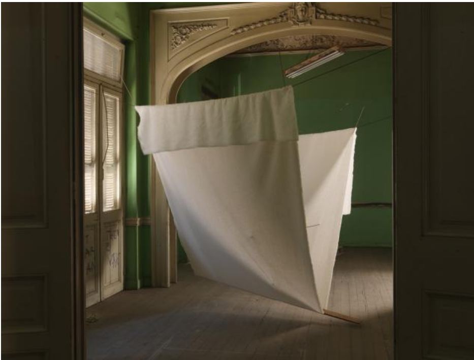
Petros Touloudis, Erechtheion , 2013, installation mixed media variable dimensions, Courtesy of the artist, Photo by Stathis Mamalakis.

The sober drama revealed by Petros Touloudis 's sui generis installations and constructions matches the subtle self-irony reflected by his videos. An intensive investigation of the connections between different artistic mediums gives his work an attribute of poetic gesture and political reflection on place and historicity.