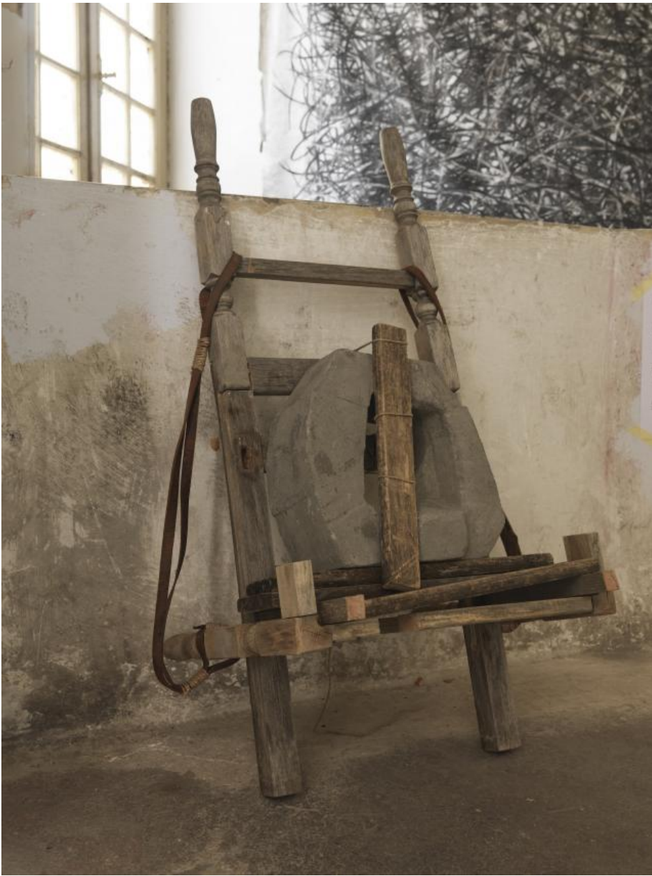
Petros Touloudis, Pilgrim's Backpack , 2013, sculpture concrete, wood, leather, strings (98 x 59 x 62 cm), Courtesy of the artist, Photo by Stathis Mamalakis.